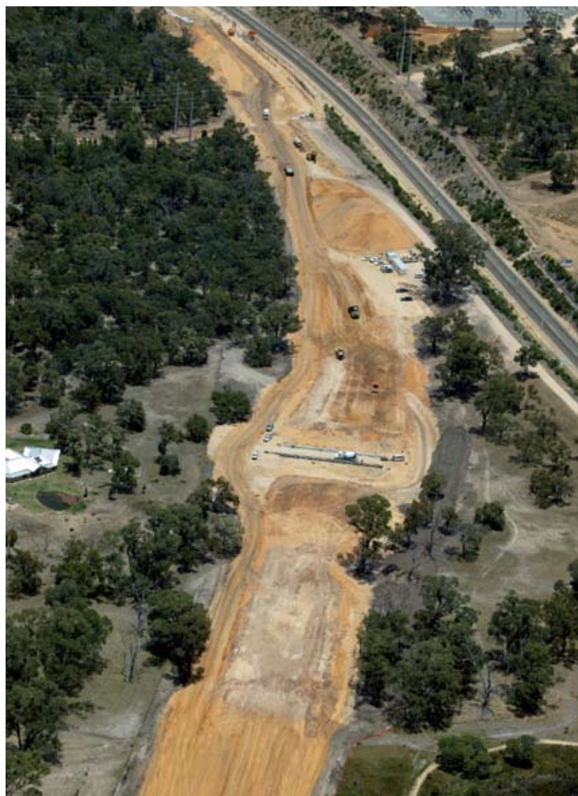
The location of the Parklands Tunnel and future Road B intersection

SGA will not be undertaking the full construction of this road as it is not currently programmed or funded by Government.