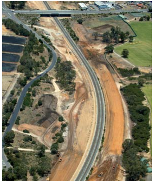
The MER south of Gordon Road in Greenfields