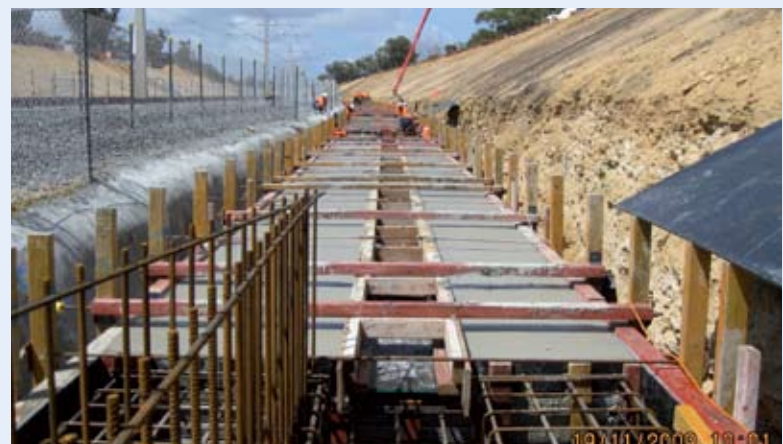
The first concrete pour for the Parklands Tunnel footings